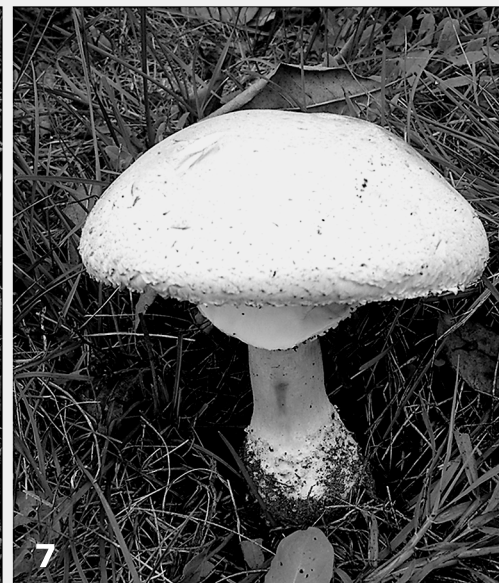
Figs 2-7. Basidiomata. 2. Agaricus albosericeus . 3. A. fissuratus . 4. A. maskae . 5. A. moelleri . 6. A. pseudopratensis . 7. A. tenuivolvatus